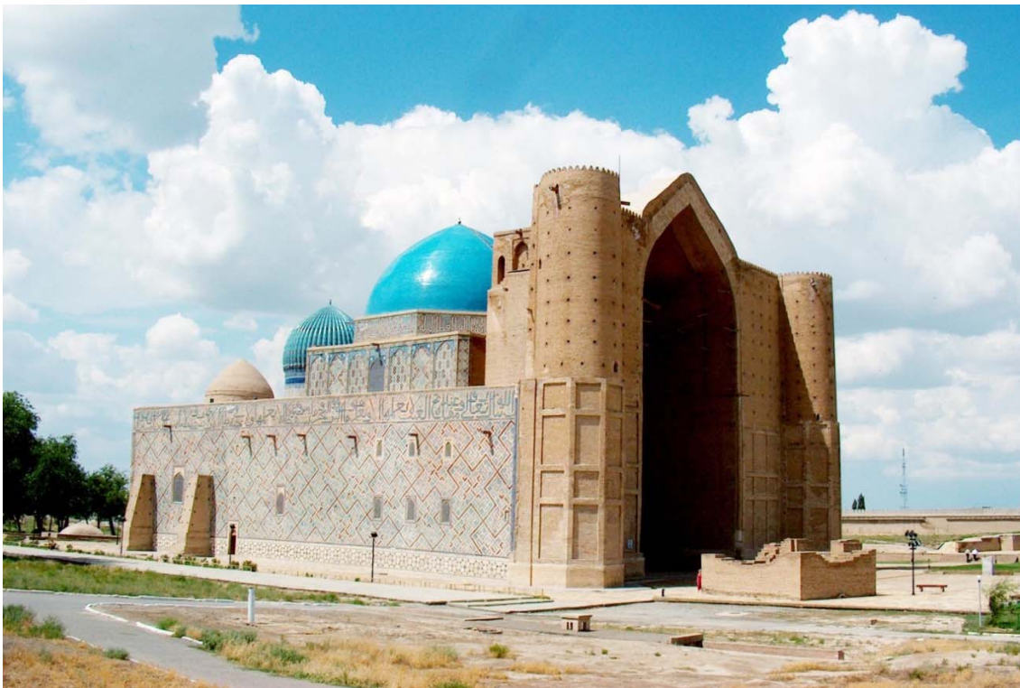
Figure 2 – Mausoleum of Khoja Ahmed Yasawi. South-East side