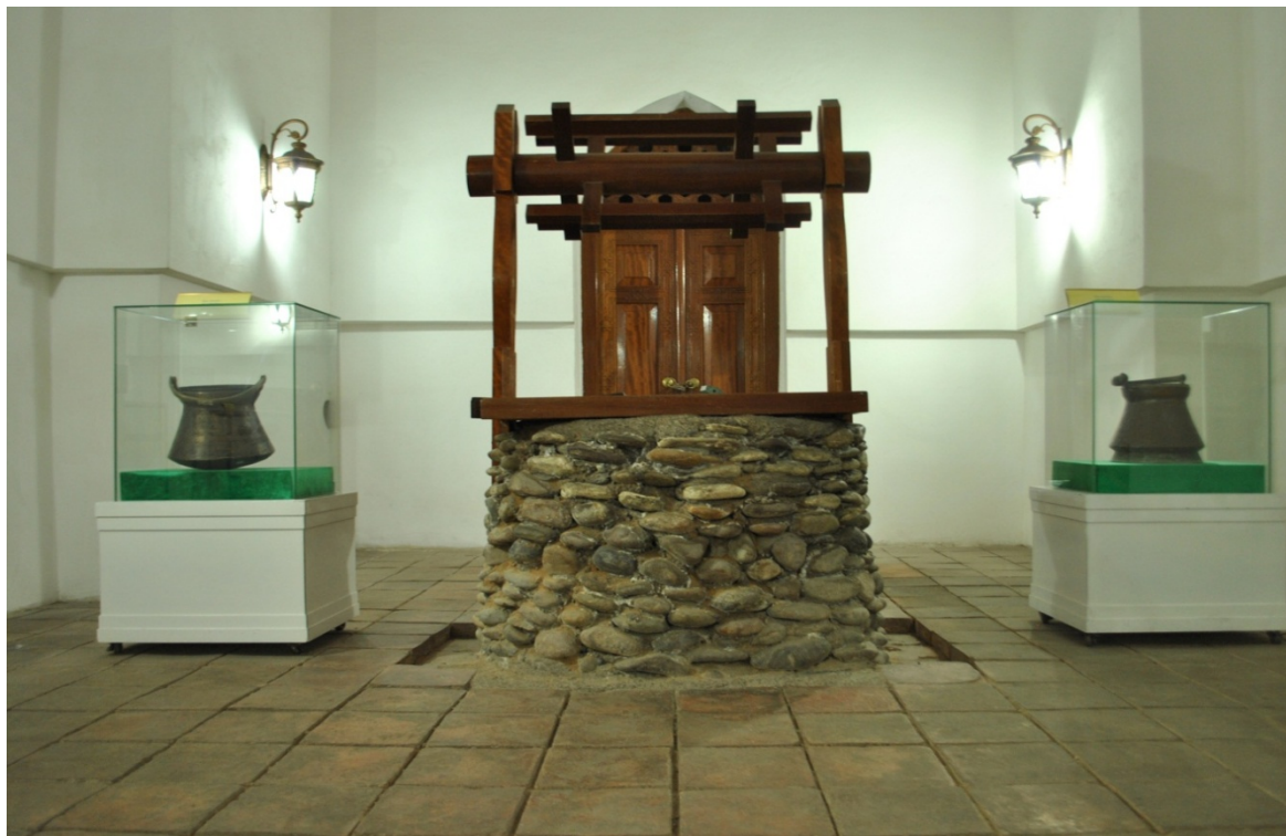
Figure 9 – Well

same time, this is one of the lightest rooms in the building. In addition to two large windows in the niches there are small gaps, the rays from which are reflected on the facing tile and give the dome a unique colorful appearance. A direct corridor links the mosque and the library. This room was called a library in the 1905 drawing diagram.