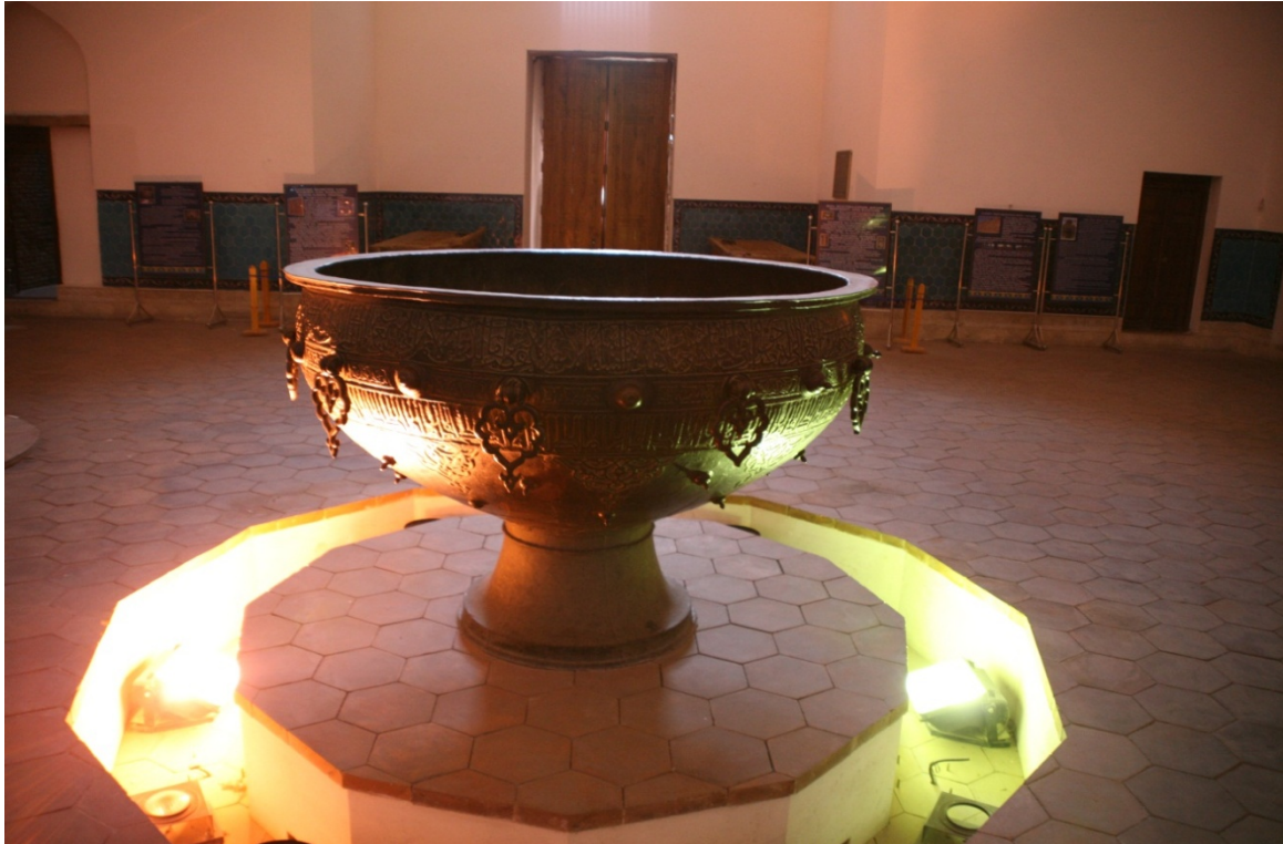
Figure 6 – Kazan located in zhamagatkhana (public hall)