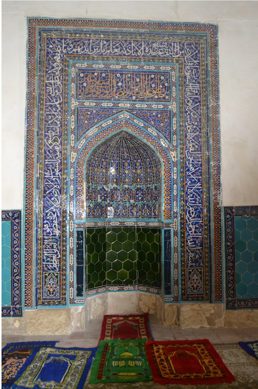
Figure 8 – Mihrab

same time, this is one of the lightest rooms in the building. In addition to two large windows in the niches there are small gaps, the rays from which are reflected on the facing tile and give the dome a unique colorful appearance. A direct corridor links the mosque and the library. This room was called a library in the 1905 drawing diagram.