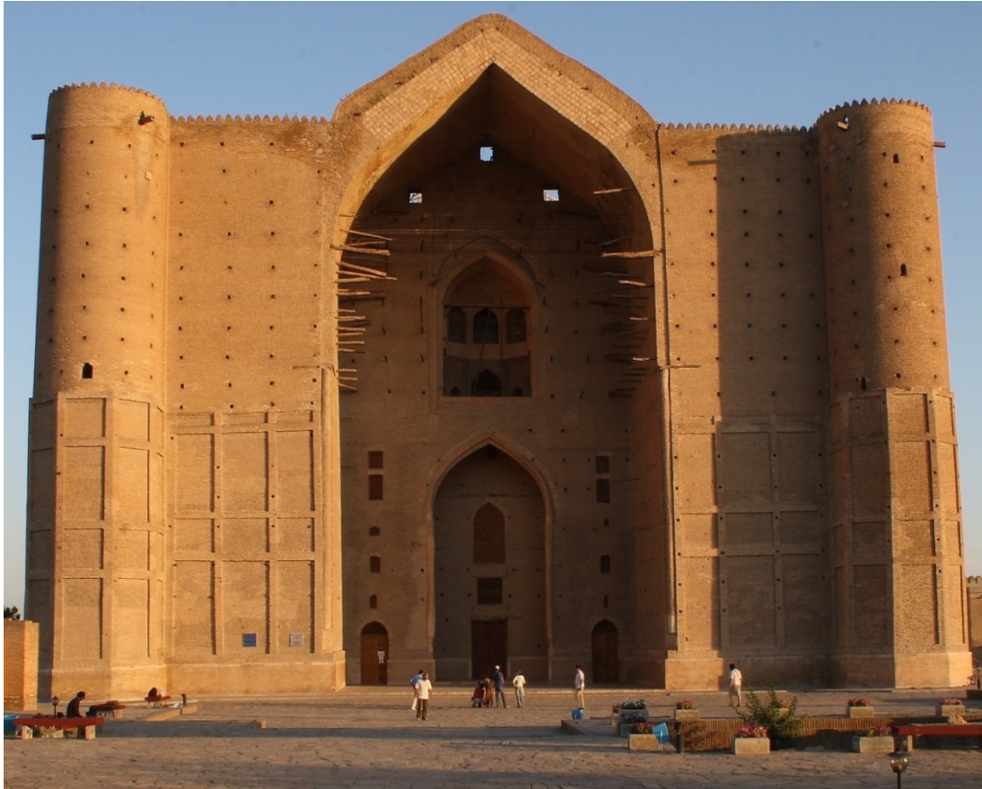
Figure 1 – Mausoleum of Khoja Ahmed Yasawi. South side