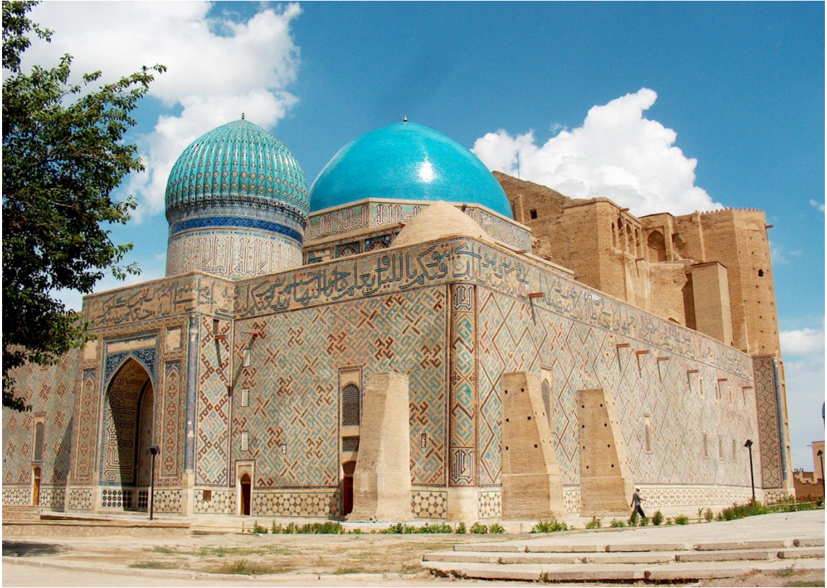
Figure 3 – Mausoleum of Khoja Ahmed Yasawi. North-East side