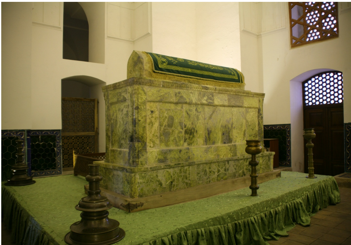
Figure 7 – Tomb