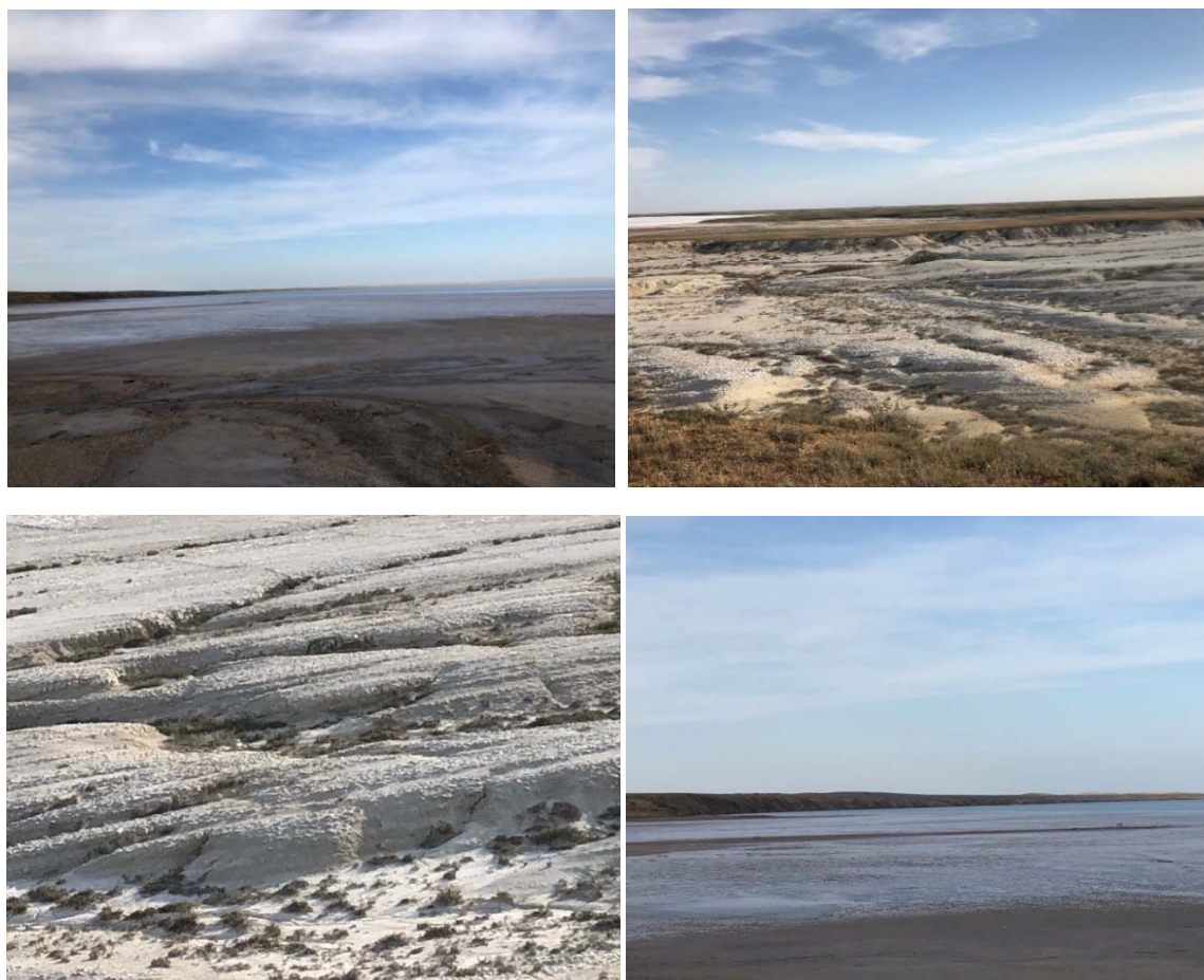
Figure 1 - Inder Lake self-settling salt

Mineral mud or black silts with healing properties are classified as fine. Mud solution is less than 50%. In the mud, particles with a diameter of more than 0.25 mm (clogging) are absent. The colloidal absorption complex is very significant.